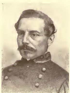
PIERRE G. T. BEAUREGARD.